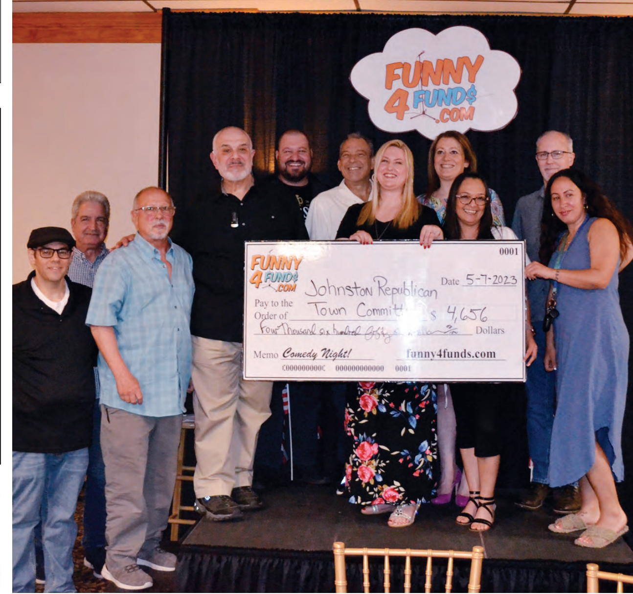
GRAND OLD PARTY PARTY: The Johnston Republican Town Committee said it held a successful comedy show and silent auction fundraiser on May 7.

Retirement comes with more time for the things you love. A reverse mortgage can help you fund them.